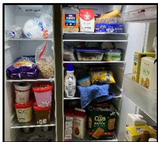
Our Refrigerator Overfloweths

KIDDOS meet during the worship service in the old Minister’s Study on the Fellowship Hall side of the building, where a more comfortable temperature can be enjoyed by all. The door to the public foyer is kept closed and locked, while the other entrance – on the hallway side – has a child’s safety gate to provide an adult access.