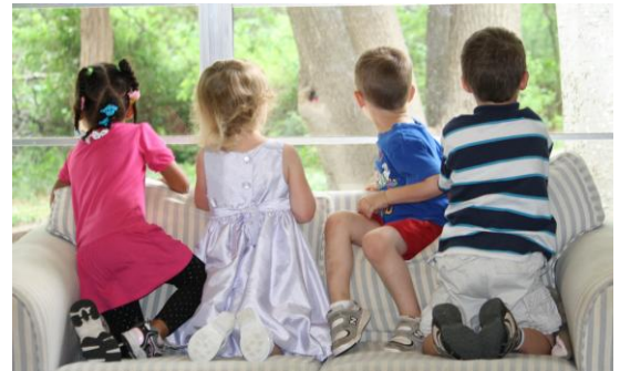
Children in the UUFW Nursery Eye Easter Eggs